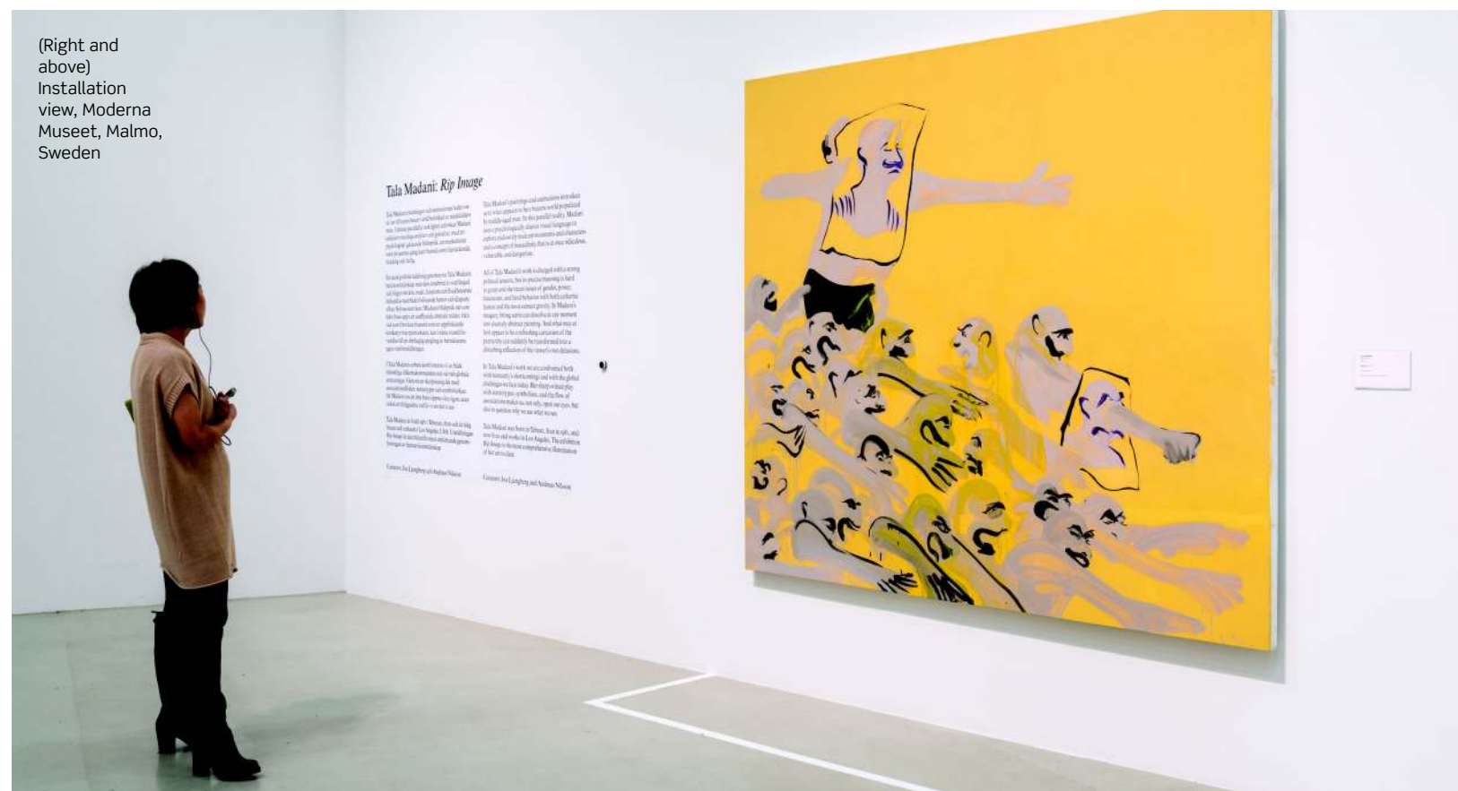
(Right and above) Installation view, Moderna Museet, Malmo, Sweden