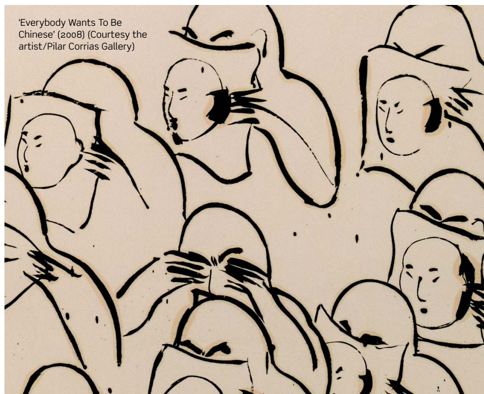
'Everybody Wants To Be Chinese' (2008) (Courtesy the artist/Pilar Corrias Gallery)

Although she uses humour as a point of entry, and subjects are simply depicted with thin brush strokes and perhaps caricatures of who they really are, to approach these works from a single perspectival view, leaves the viewer confused, dumbfounded and as whimsical as the men being portrayed. HBA